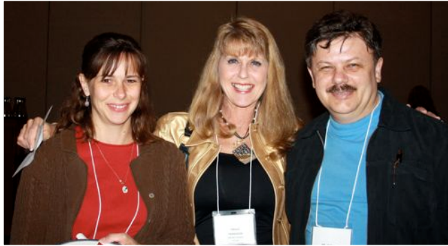
Some candid photos of the NAPANc conference May 28 - 30, 2010 Calgary, Alberta